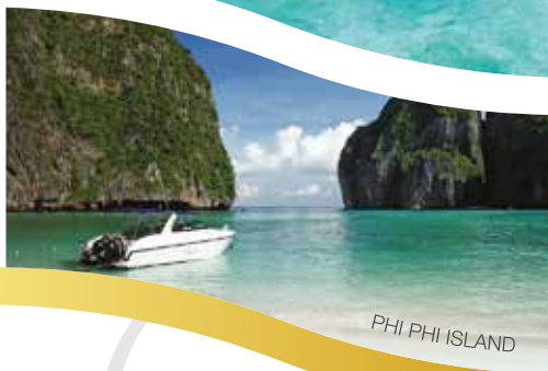
PHI PHI ISLAND