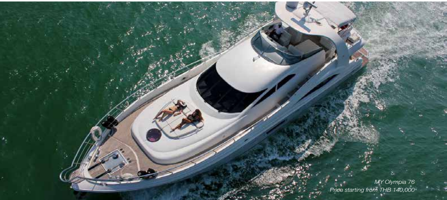
MY Olympia 76 Price starting from THB 140,000