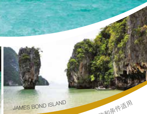
JAMES BOND ISLAND