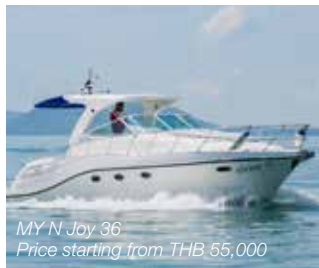
MY N Joy 36 Price starting from THB 55,000