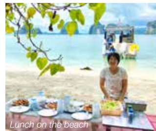
Lunch on the beach