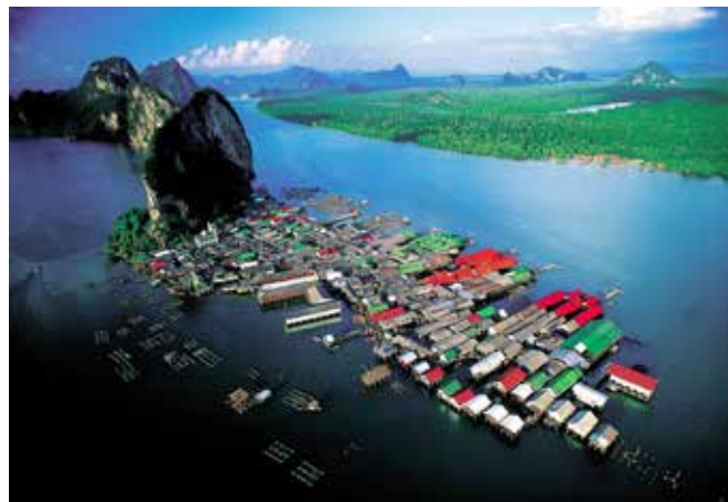
EXCURSIONS BY LAGUNA TOURS

4-in-1 Speedboat Tour: 1. Sea Cave 2. James Bond Island 3. Sea Kayaking 4. Sea Gypsy Village. See it all in one day. Visit and explore Sea Cave, James Bond Island, enjoy a delicious Thai and seafood lunch at the Sea Gypsy Village which is built entirely on stilts above the water, be tantalised by the exciting, exclusive sea kayaking tour through the caves and spectacular islands.