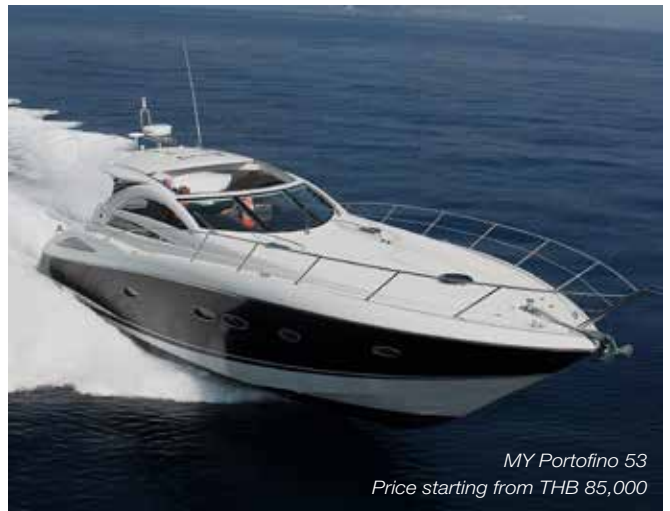
MY Portofino 53 Price starting from THB 85,000

Our well known stylish MY Olympia 76 is ready to take you to exotic and remote private beaches, as well as exciting afternoons of waterskiing, wakeboarding or fishing.