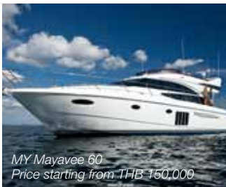
MY Mayavee 60 Price starting from THB 150,000