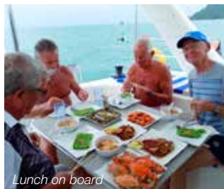
Lunch on board